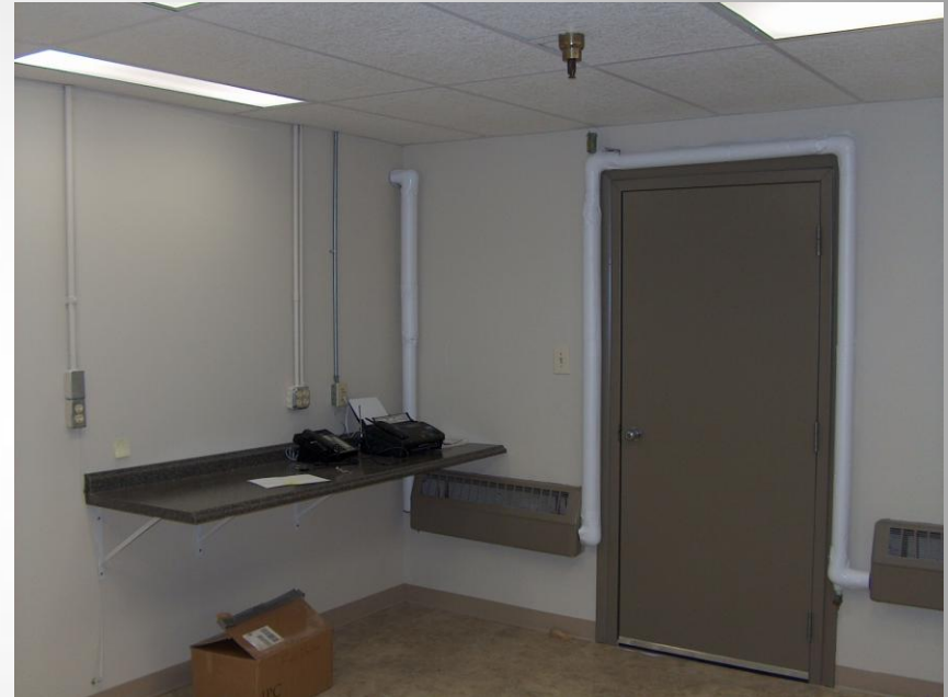
Exam Room (looking from HBPA Horsemen's Lounge towards entrance)

The Horsemen's Wellness Center @ Turfway Park is a three way partnership between the Nursing School at Northern Kentucky University, Turfway Park, and the Kentucky Racing Health and Welfare Fund.