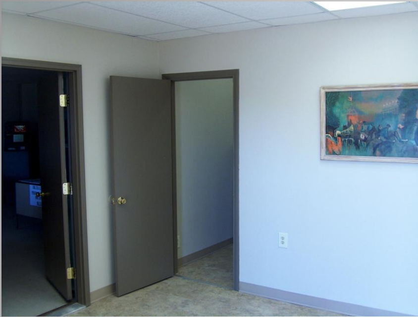
Exam Room (looking from Center's outside door at the HBPA Horsemen's Lounge, left, and file/supply/sink room

We were able to double the space of the Center when we added a door in the wall to gain access to the HBPA Horsemen's Lounge, which will serve as a waiting room. The Center will not be open during racing hours and there is no risk of mixing the patients with the general population that frequents the Lounge. Patients will enter the Lounge from its own outside entrance, enter the Center from the Lounge, and exit the Center through its outside door.